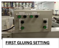
FIRST GLUING SETTING

WHY 4: Standard measurement/setting not follow.